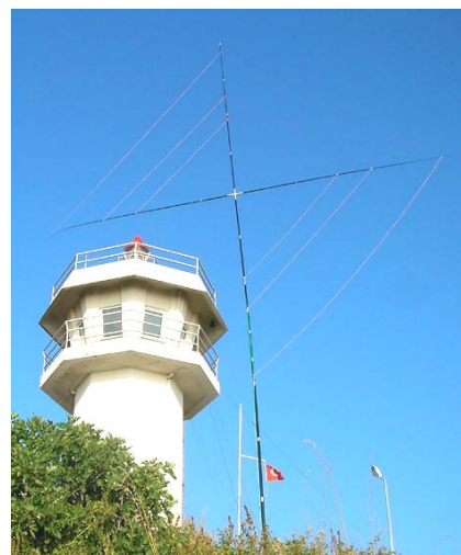
1el Quad 20/15/10 on 12m fiberglass pole

The metal center joint has very small packaging dimensions, as it can be disassembled completely. The kit is well suited for building a 1el Quad for 20m and all bands above.